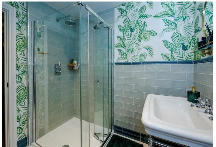
Luxury Shower Room