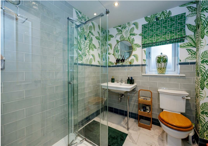
Luxury Shower Room